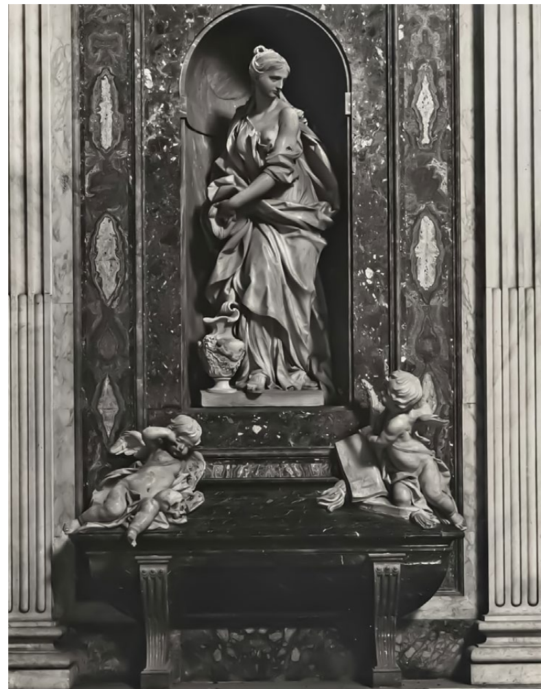
2 Filippo Della Valle, Allegory of Temperance . Rome, Basilica of San Giovanni in Laterano