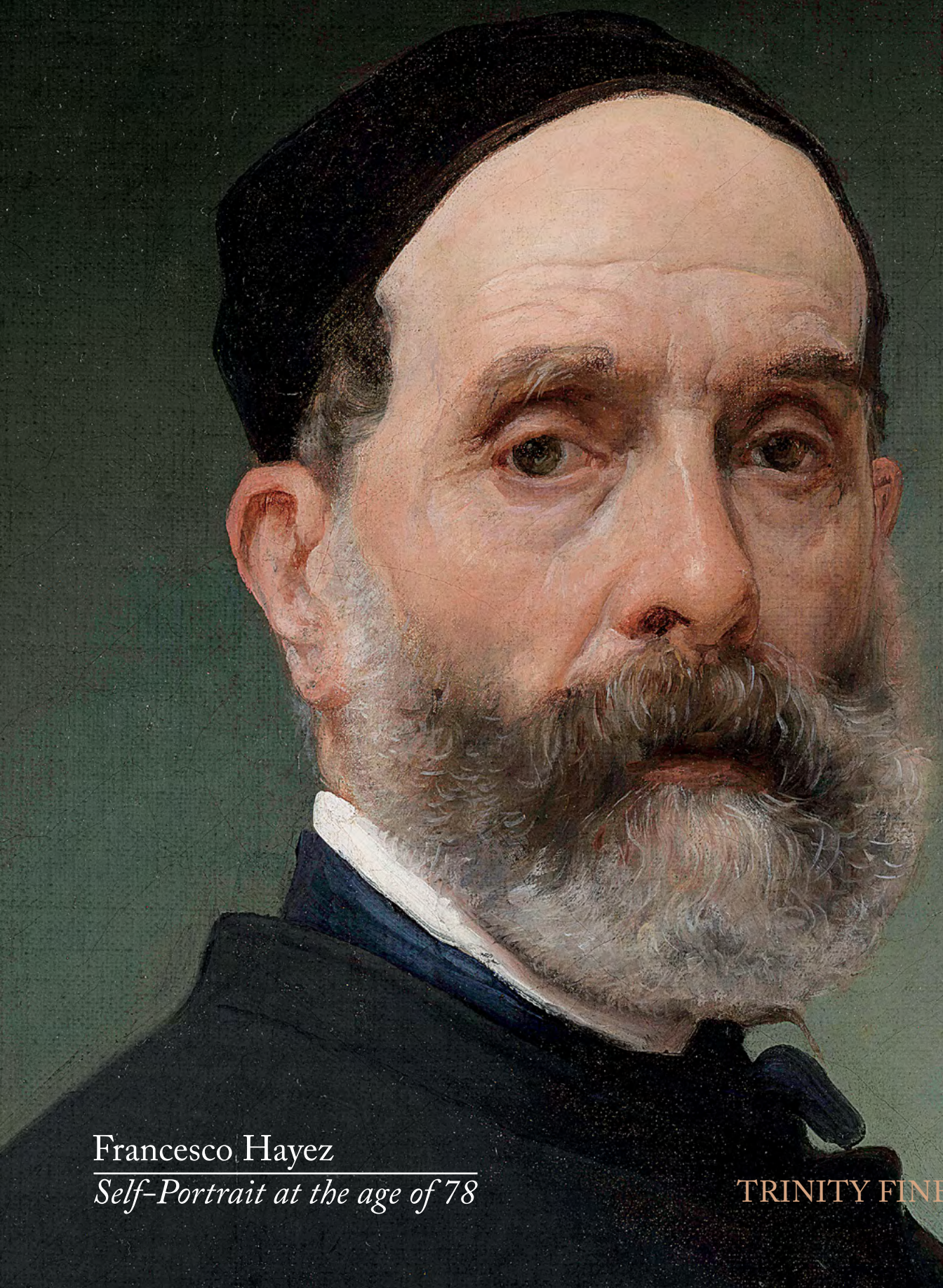
Francesco Hayez Self-Portrait at the age of 78