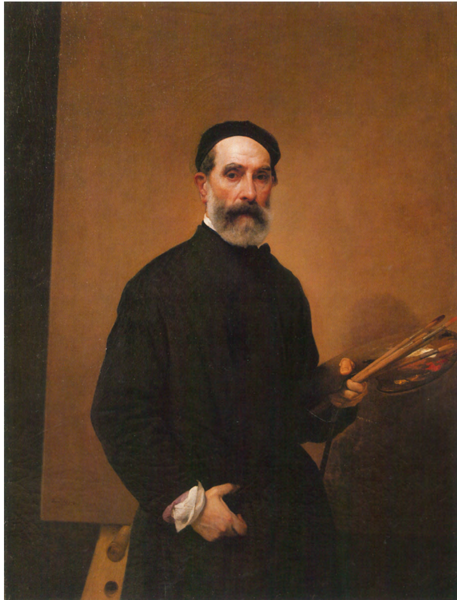
Fig. 1: Francesco Hayez, Self-Portrait at the age of 71 , Florence, Gallerie degli Uffizi

emerging from the cuff of his shirt sleeve all point, in particular, to the version in Venice. The choice of a close-up view and the absence of the canvas behind him, however, have allowed the painter, in avoiding all reference to his atelier , to focus on capturing his own facial features both in their physical characteristics,