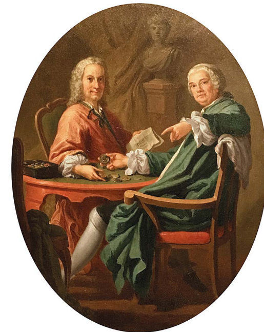
Fig. 1: Giuseppe Zocchi, Andrea Gerini (on the right) with Anton Maria Zanetti, Museo Correr, Venice

The sculptor Giovan Battista Piamontini, son of Giuseppe Piamontini, and a representative of the Marchese Andrea Gerini and his nephew Carlo Francesco signed an agreement in Florence on New Year's Day 1761. According to this agreement 1 Giovan Battista Piamontini would sell the Gerini family a marble statue by his late father, the better-known Giuseppe Piamontini, and he himself would carve a marble companion piece for it. Giuseppe's statue was described simply as 'depicting a Milo'— who Strabo 2 tells us was 'the most renowned of wrestlers' in the ancient world. His son's sculpture was to depict a Faun 'with a kid on his shoulders'.