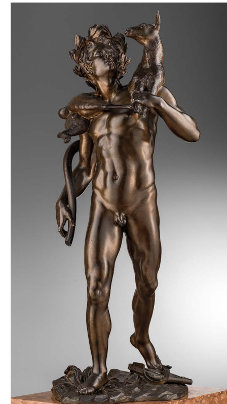
Figs. 3,4: Faun with a Kid (130–150 AD), Madrid, Museo del Prado, marble, height 155 cm; Giuseppe Piamontini, Faun with a kid after the Antique, bronze, height 62 cm, Florence, Museo Nazionale del Bargello

catalogue, other than for the now lost Bust of Magalotti . But given that the catalogue regularly refers to the ownership of the works displayed at this exhibition, this would suggest that these sculptures were in fact made with an eye to selling them and that they were still with the sculptor, whose workshop stood just around the corner from to the exhibition venue in the Sapienza and who could thus have easily brought his sculptures over to show them to the public on this prominent occasion. 4 If the Gerini Milo is indeed the one shown in 1729, then that would mean that the sculptor worked on it – on and off – for over a decade, an assumption