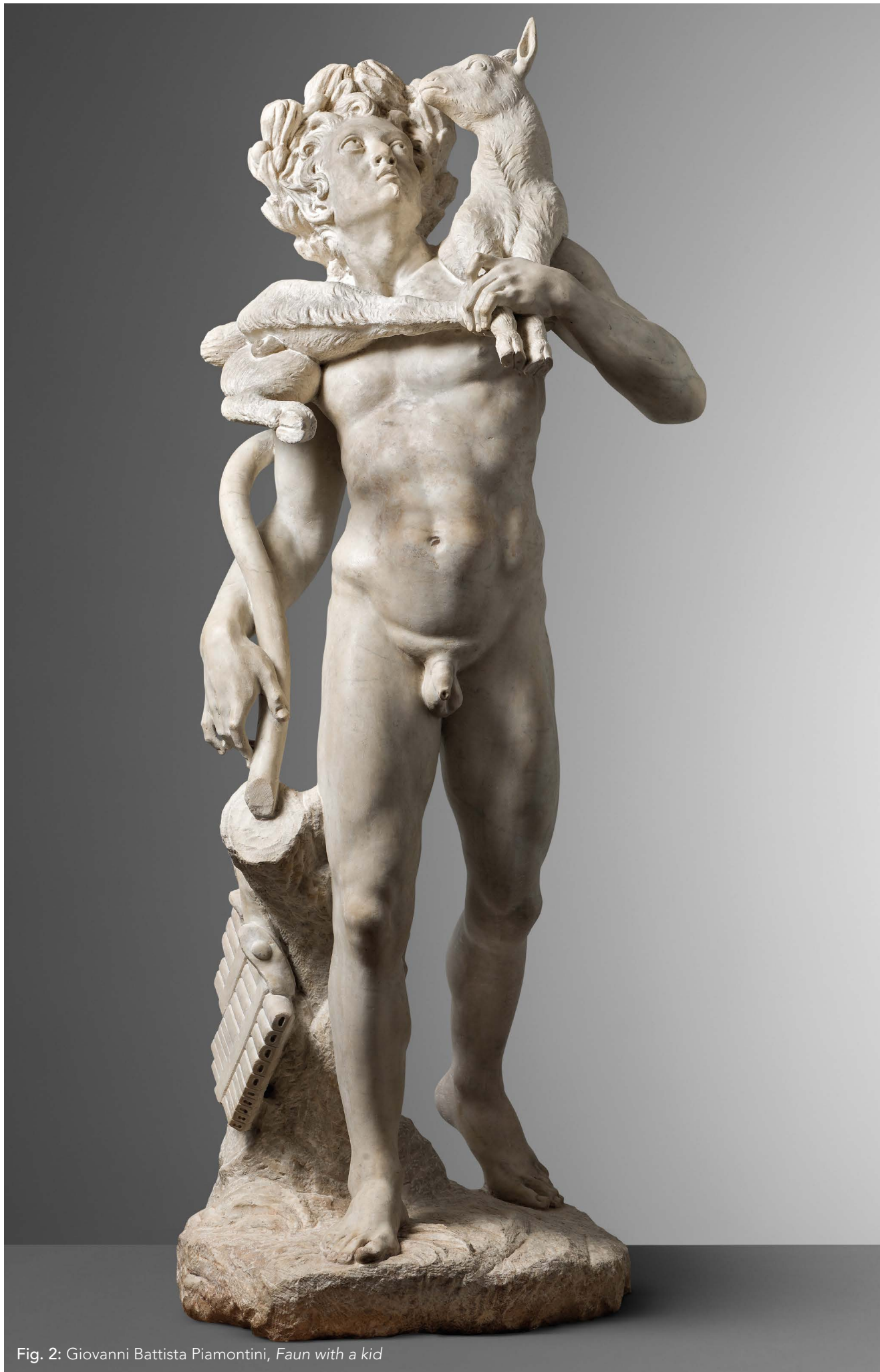
Fig. 2: Giovanni Battista Piamontini, Faun with a kid