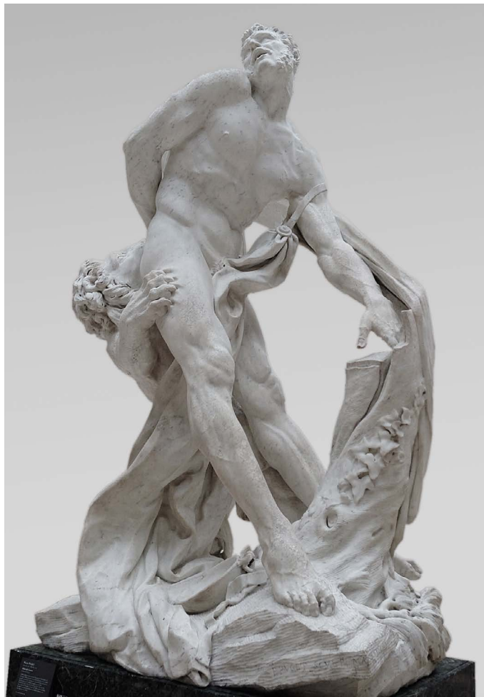
Fig. 5: Pierre Puget, Death of Milo , marble, height 270 cm, Paris, Louvre

Evidence against our assumption, on the other hand, includes the fact that he would have embarked on carving a complex work at his own expense without knowing whether he could ever sell it – a practice not otherwise known in the sphere of Late Baroque Florentine marble sculpture.