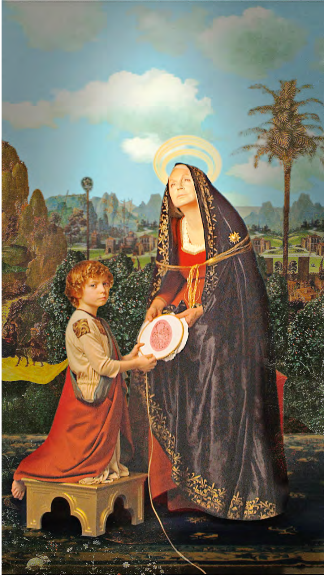
Fig. 1: Francesco Vezzoli, Portrait of the Artist's Mother (after Pinturicchio) , 2011, video installation, colour, sound, 2' 15'', Prada Collection – Milan, Private Collection – New York & Turin