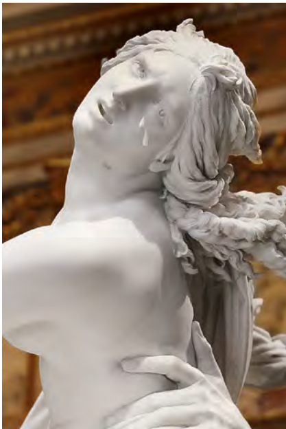
Fig. 5: Gian Lorenzo Bernini, The Rape of Proserpine (detail), Borghese Gallery, Rome

AB At the start of your career you often embroidered tears, intervening on standard works in Western art. The Baroque 17th century is a century jam-packed with tearful saints and heroines; one has but to think of the paintings of Carlo Dolci and Guido Reni, or of Bernini's Proserpina at the Borghese, with an unprecedented sculpted tear (fig. 5). Do you think that 17th century art lay at the origin of your tears, or was it primarily postwar films, or even some other source?