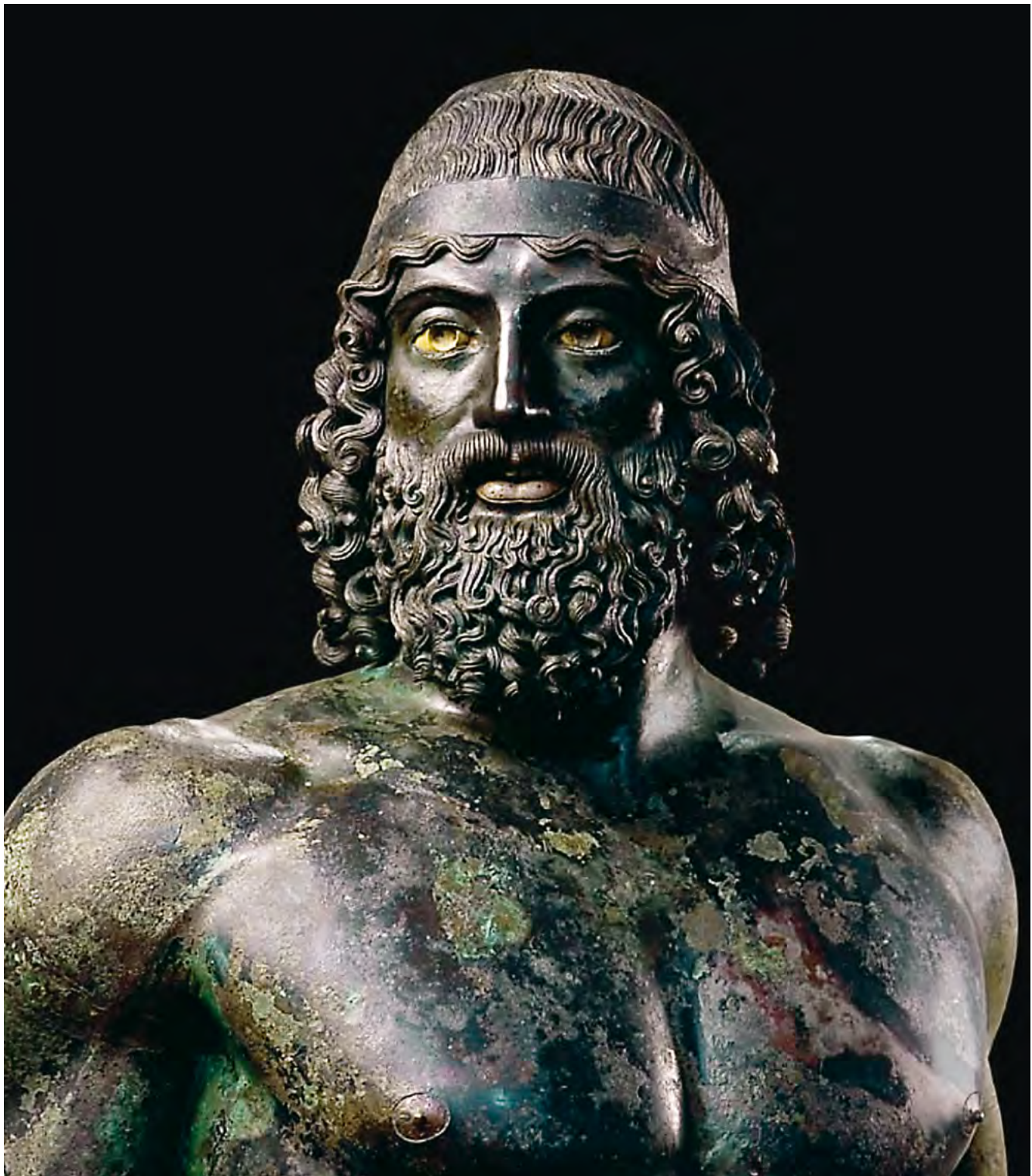
Fig. 4: Statue A, Riace Bronzes, Reggio Calabria, Archeological Museum of Reggio Calabria