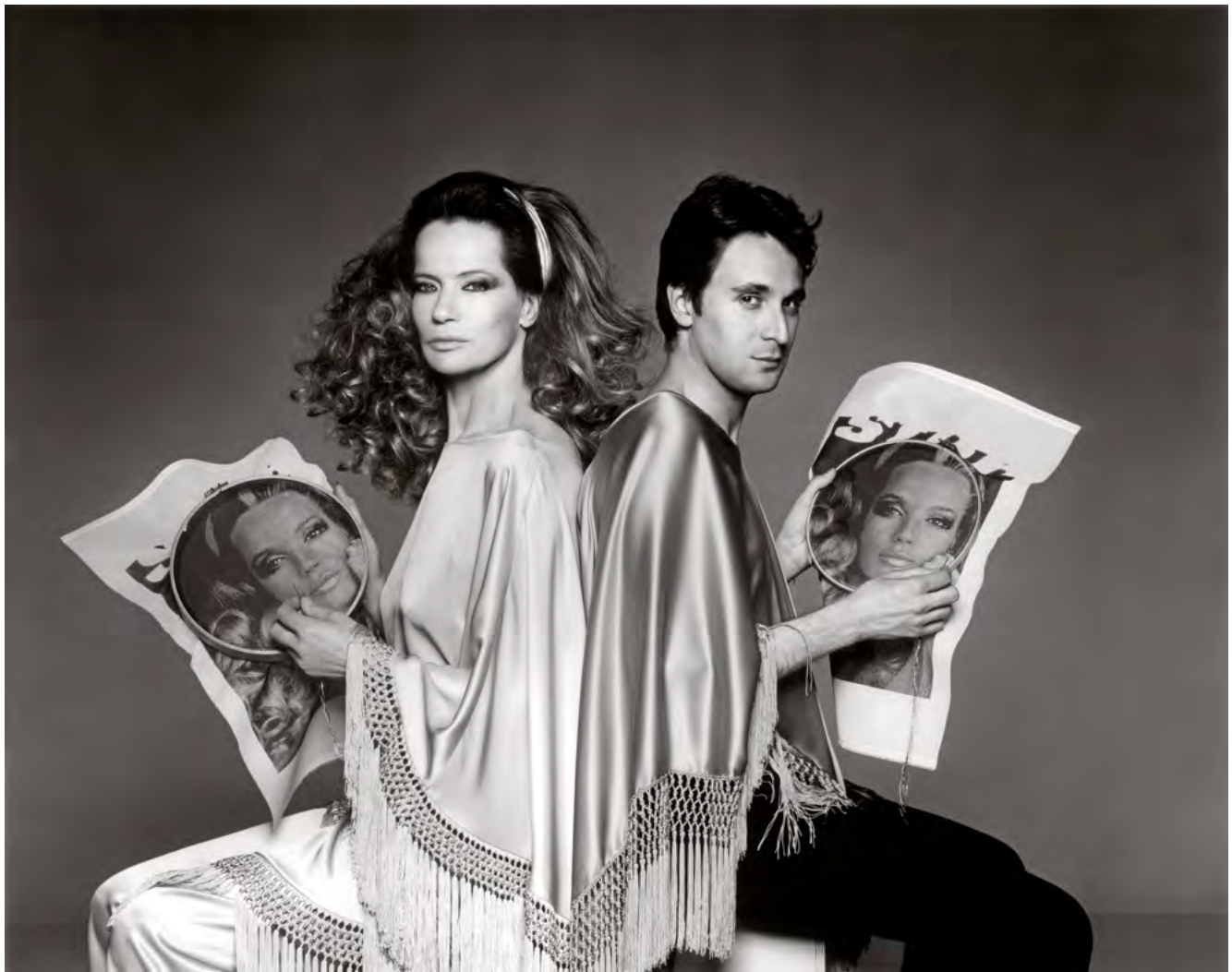
Fig. 7: Francesco Vezzoli, Self-Portrait with Vera Lehdorff as Veruschka, 2001, Digital Print on Aluminium, 120 x 125 cm, AGI Collection - Verona