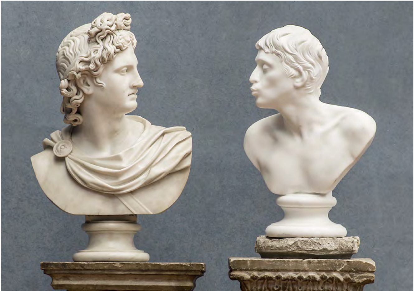
Fig. 11: Francesco Vezzoli, Self-Portrait as the Apollo Belvedere's Lover , 2011, contemporary self-portrait bust sculpted in marble, 76 x 51 x 50 & 85 x 52 x 50 cm, Prada Collection - Milan