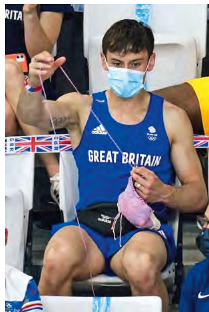
Fig. 6: Tom Daley knitting a sweater at the Tokyo Olympics, 2020

I put all my emotional charge, all my intensity into it. The important thing for me is that it was an original gesture, I wasn’t interested in what people might read into it. Where gender disparity is concerned,