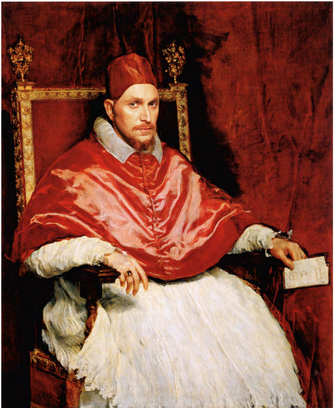
Fig. 8: Francesco Vezzoli, Self-portrait as Pope Innocent X (after Diego Velázquez), 2013, inkjet print on rag paper, 158 x 128 cm, private collection, Germany