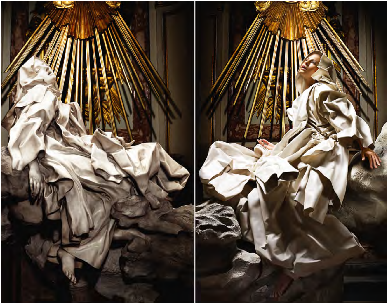
Fig. 2: Francesco Vezzoli, La Nuova Dolce Vita (from the Ecstasy of Saint Teresa to Eva Mendes ), 2009, neon signs, 234 x 150 cm each, Prada Collection – Milan, Rennie Collection – Vancouver, Vanhaerents Collection, Brussels